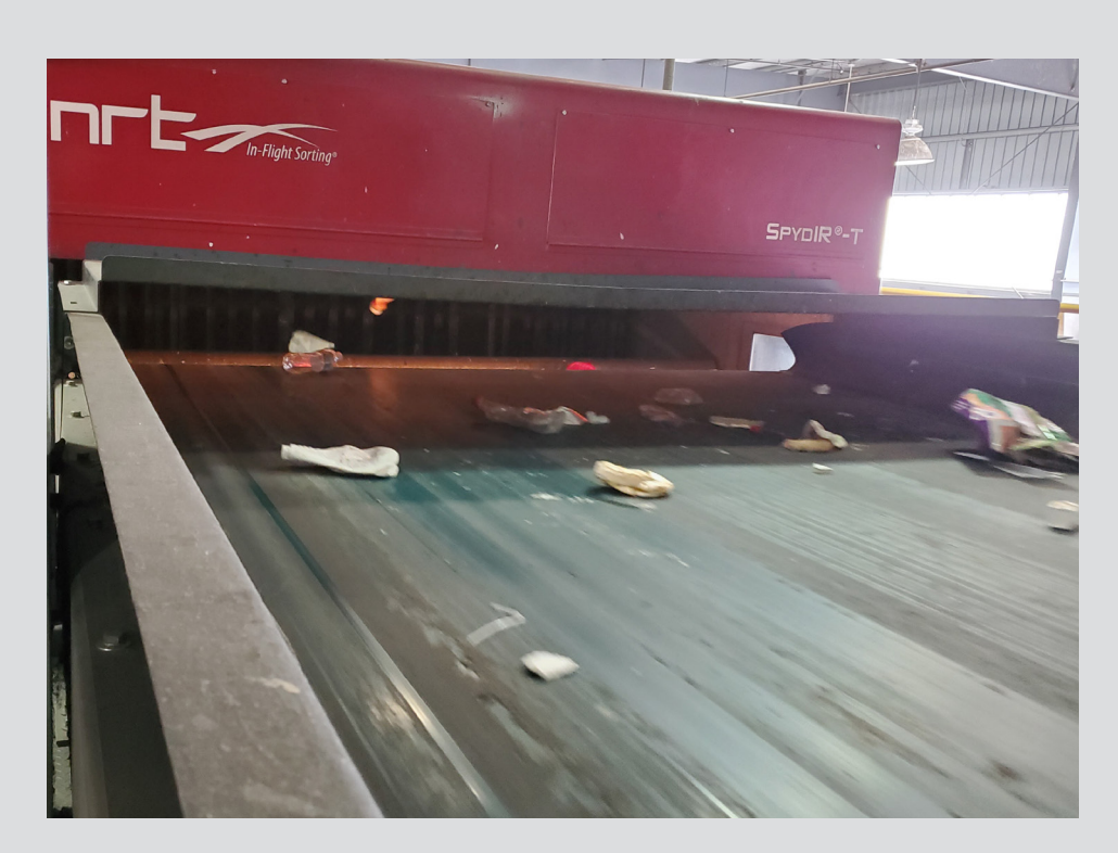
Figure 1: An optical sorter at work.

Despite their advantages, optical sorters are imperfect. The reflective scanning mechanism cannot recognize black plastic items, nor can it identify plastic products that are contaminated with food or another residue. Lightweight plastic items may also be problematic, as they are not easily redirected by the air jet used to separate valuable material. Such problems illustrate the need for better alignment between product specifications and options for endof-life disposal.